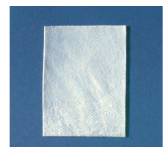
Geistlich Bio-Gide® provides excellent wound stability and graft containment

"The combination of Geistlich Bio-Oss® and autologous bone chips provides the best chance for regeneration while maintaining the hard and soft-tissue contours."