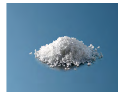
Geistlich Bio-Oss® provides long-term volume stability

"This case demonstrates the importance of meticulous incision design, flap advancement, and suturing technique to ensure adequate blood supply and nutrients to the graft material and to maintain primary closure throughout the course of healing."